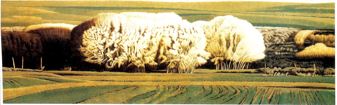
▲ DOVE CREEK WITH RED SKY, OIL ON PANEL, 18 X 36"